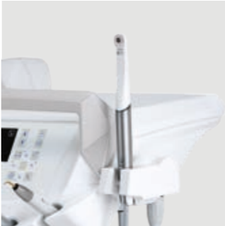
Sixth instrument The international dentist's module can be completed with an optional sixth instrument: camera or T-LED light.