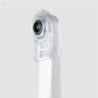
Macro Cap An extremely useful accessory, Macro Cap can magnify up to 100x in ultra-high resolution. Three additional, high purity glass lenses optimise lighting of details located close to the optical unit.