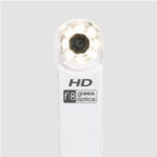
C-U2 HD camera The video camera aids dentist-patient communication and, thanks to the slender handpiece design, it can reach distal zones with ease. Excellent depth of field eliminates any need for manual focusing. Speeds up diagnostics and generates material for documenting the treatment and completing clinical reports.