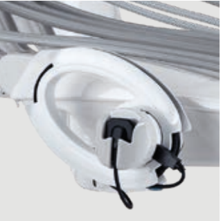
Zen-X X-ray sensor Extractable sensor with USB lead located on the dentist's module, can capture high-resolution images with minimal radiation dosage. Able to be sanitised, the sensor comes in two different sizes and is IP67 certified against water and dust infiltration.