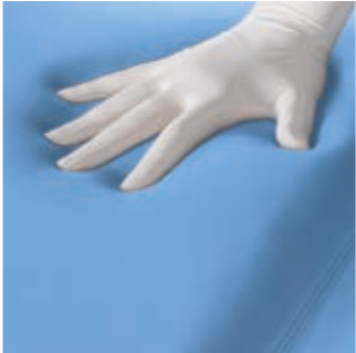
Memory Foam Exceptional comfort and proper anatomical support thanks to special upholstery options.

The optional Nordico backrest ensures lasting comfort during protracted treatment sessions and is shaped to aid dentists who work in 'indirect vision' mode.