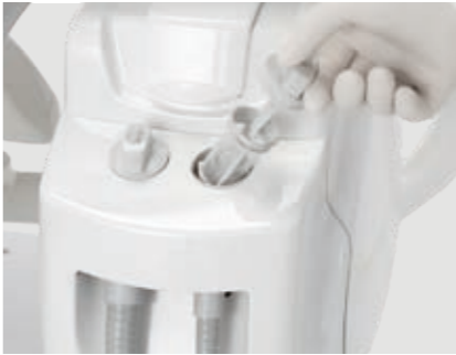
A.C.V.S. Automatic system that carries out suction system sanitisation cycles between one patient and another. Practical and fast.