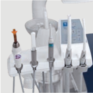
Assistant's module The module mounted on the double-articulated arm is height-adjustable and comes with three holders as standard. An optional 5-holder version is also available: this can be used to hold other instruments such as a video camera or T-LED light. The keypad incorporates controls that move the patient chair, switch on the operating light and operate the water-to-cup and cuspidor bowl rinse functions.