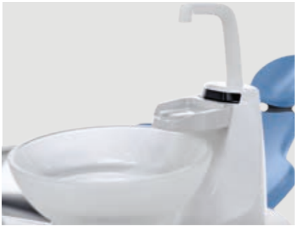
Cuspidor bowl with optical sensor The glass cuspidor bowl rotates and can be removed for cleaning purposes. Incorporated in the cup and bowl fill unit, the optical sensor automates cup filling.

BIOSTER S210LR can be equipped with the automatic BIOSTER system. This device performs fast, intensive disinfection cycles on spray water circuits. Each stage of the cycle is automatically controlled by the dental unit. Dentists can personalise settings as desired. The cycle stages are: • Introduction of compressed air into water pipes to empty them • Withdrawal of disinfectant from tank and introduction into spray water circuits • Liquid remains in ducts for indicated time • Liquid expelled with compressed air • Flushing with (mains or distilled) water By using Peroxy Ag+, the BIOSTER ensures high-level disinfection of the water circuit. Analysis carried out by the Sapienza Università of Rome has demonstrated that the disinfection provided is sufficient to "eradicate all tested microbes from the piping of the dental unit, even with higher contamination levels."