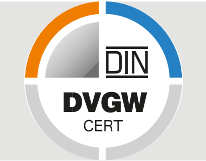
DVGW CERTIFIED The dental unit water circuit is EN 1717 compliant.