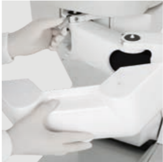
Support release Once the cover has been removed just free the mechanism that allows re-positioning from right to left and vice versa.

Ideal for multi-operator surgeries where both right-handed and left-handed dentists practice, the S210LR can be re-positioned in just a few quick, simple steps that require neither tools nor technicians. The switch can even be made by the assistant on his/her own. The dentist's module rotates on the fixed pin under the seat; the unit body - arm and assistant's module included - can be moved from one side to the other after releasing the support.