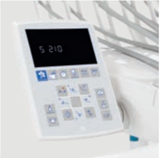
Re-positionable control panel Continental model users can move the control panel to the opposite side of the dentist's module, thus optimising ergonomics and making the dental unit 100% ambidextrous. Just rotate the on-panel connector 180° and reconnect it to the tablet. The task takes less than a minute.