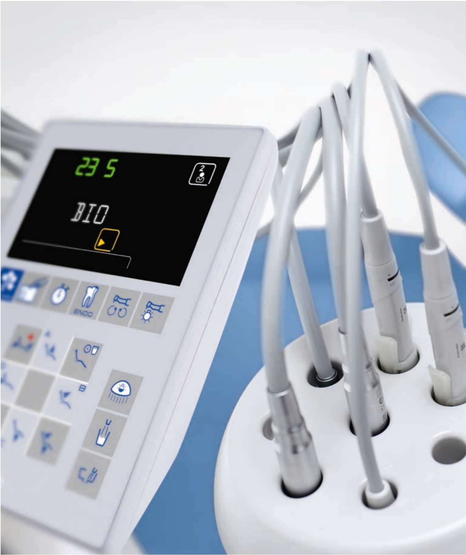
The instruments are inserted in the tray above the cuspidor bowl throughout the BIOSTER cycle.

Free to configure the dental unit with a broad selection of active devices as desired, dentists can also count on a design concept with an array of features that safeguard patient and surgery staff alike.