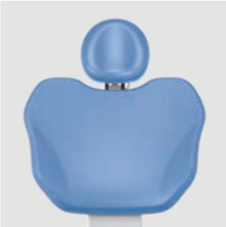
Standard backrest Shaped so that dental staff can move closer to the patient during treatment. Suitable for adults, children and any treatment type.