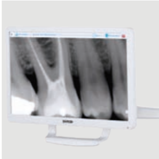
22" LED Monitor 93/42/EEC certified, the monitor is also available in the multitouch version; the screen can be positioned as desired.

Coupled with a latest-generation HD video camera, the Full HD 16: 9 tilt-adjustable 1920 x 1080 pixel flat screen medical monitor can be lead-connected to a PC. The LED light sources ensure high levels of contrast and brightness, while the IPS panel, which significantly broadens the screen viewing range, allows images to be comfortably viewed from any angle.