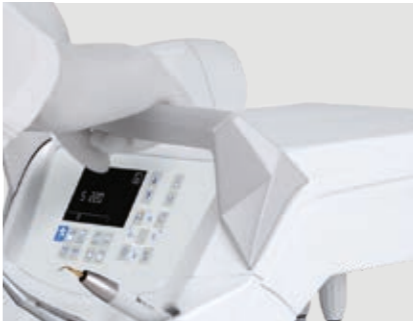
Removable International handle The handle can be removed for in-depth sanitisation; removal also makes it easier to clean the dentist's module and instrument control panel.