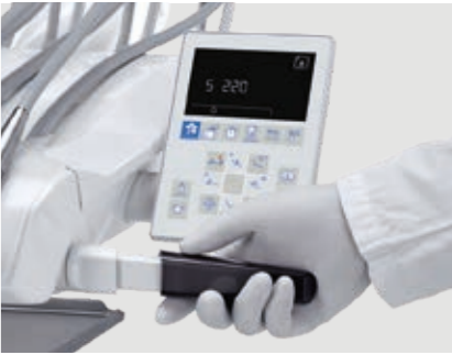
Removable Continental handle The new dentist's module handle can easily be removed for thorough sanitisation.