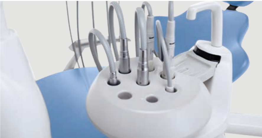
I.W.F.C. Activated via the control panel, the device ensures tubing is kept clean after the machine has remained idle for a time. Included in the BIOSTER or available separately.

Free to configure the dental unit with a broad selection of active devices as desired, dentists can also count on a design concept with an array of features that safeguard patient and surgery staff alike.