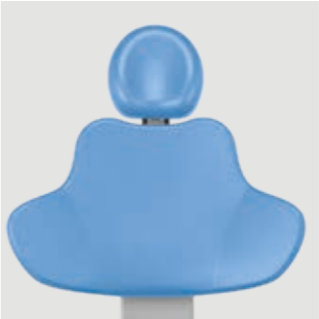
Nordic backrest Ensures lasting comfort during protracted treatment sessions and shaped to aid dentists who work in 'indirect vision' mode.