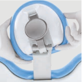
Atlaxis headrest The headrest that follows the patient's anatomy. Ultra-simple fingertip release of the pneumatic lock allows orbital movement to achieve perfect positioning, vertical adjustment included.