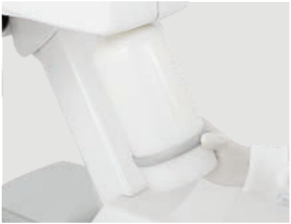
SANASPRAY Tank with distilled water as an alternative to mains water.