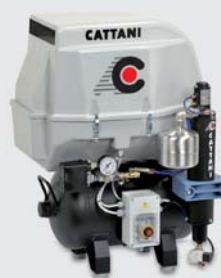
Noise reducing hood

AC1800 and larger systems, it is recommended that you sound proof the room.