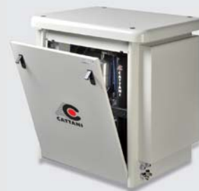
Noise reducing cabinet Product Code: 010800